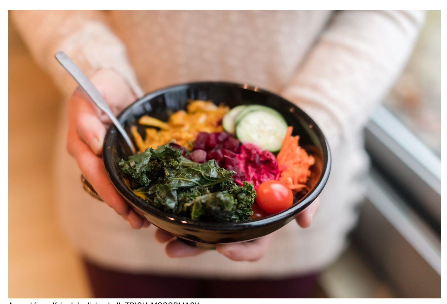
A meal from Kripalu's dining hall.

dinners are heavy on greens and grains, but the two evening meals during my stay included an Italian chicken dish and shrimp puttanesca. Some meals are completely vegetarian; one of our lunches featured curried chickpeas as the entrée. Desserts are minimal and healthy: Saturday night's fruit crisp tasted like it contained one-tenth the sugar I use when making one at home. Picky eaters or meat-and-potato types won't love some choices (pro tip: full menus can be viewed online in advance), but I enjoyed the food — and after just 24 hours of eating this way, my body started to feel different. This was partly due to the high-fiber, low-fat food that kept me from overeating. But mostly, I suspect, the lack of sugar sent my body into a blissful detox.